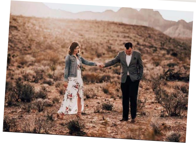
Together we can