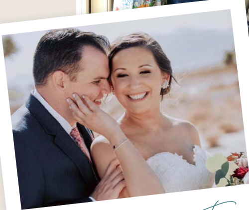
Love + support