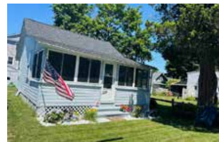
OUR COZY COTTAGE