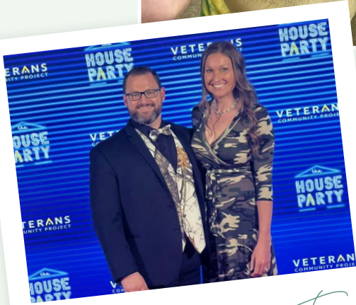
Love + support