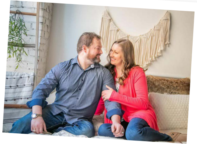
Together we can