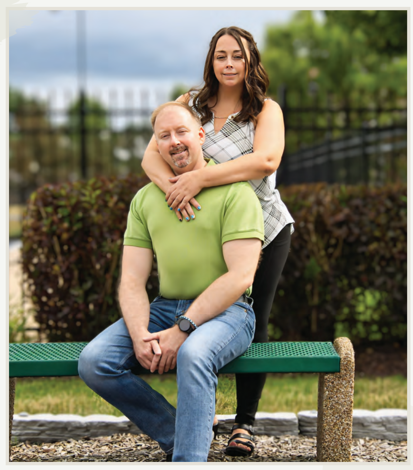
OUR ADOPTION JOURNEY