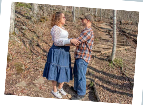
Love + Support