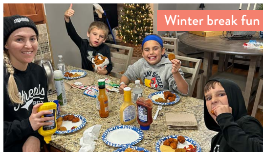
Winter break fun